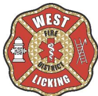
West Licking Joint Fire District