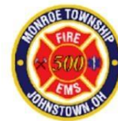
Monroe Township Fire Department

Adjustment: Include $75 / hour, minimum 1 hour for review, if applicable, and apply fee schedule according to Table C