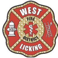
West Licking Joint Fire District