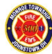
Monroe Township Fire Department