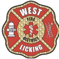
West Licking Joint Fire District