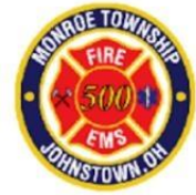
Monroe Township Fire Department