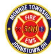
Monroe Township Fire Department