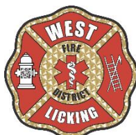
West Licking Joint Fire District