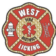
West Licking Joint Fire District