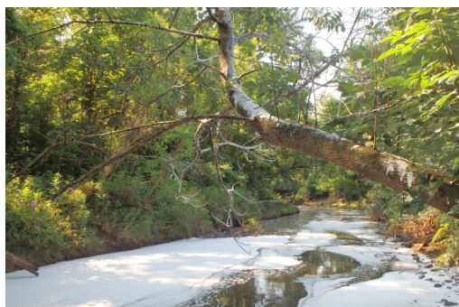
Stream full of suds from stormwater system