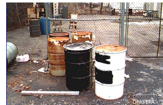
Improper outdoor storage—no secondary containment