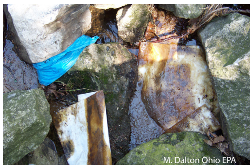
Pads used to absorb cooking oil that entered a stream from improper filter cleaning

Power washing water must be contained and disposed of either to a sanitary sewer, possibly after pre-treatment, or as hazardous waste. Before hiring a contractor, know what he or she does with wastewater.