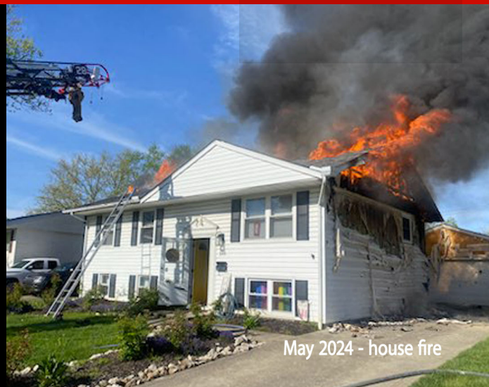
May 2024 - house fire

Have questions? Email to: fire@mifflin-oh.gov .